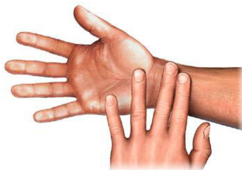
Illustration Copyright © 2005 Nucleus Medical Art. All rights reserved. www.nucleusinc.com

Wrist Method: With the palm of your partner’s hand facing up, place the tips of your first two fingers on the fleshy part of your partner’s thumb. Slide your fingers about 2 inches toward the wrist, stop, and press firmly to feel the pulse of blood which each heart beat sends through the artery. To measure heart rate, count the number of pulses in 30 seconds. Multiply that number by 2, and you will have the number of beats per minute (“bpm”).