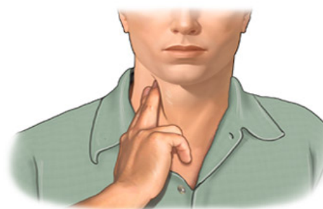
Illustration Copyright © 2005 Nucleus Medical Art. All rights reserved. www.nucleusinc.com

Neck Method: Place the tips of your first two fingers on either side of your windpipe, near the lump, called an Adam’s apple, in the middle of your neck. Press gently until you can feel a pulse. To measure heart rate, count the number of pulses in 30 seconds. Multiply that number by 2, and you will have the number of beats per minute (“bpm”).